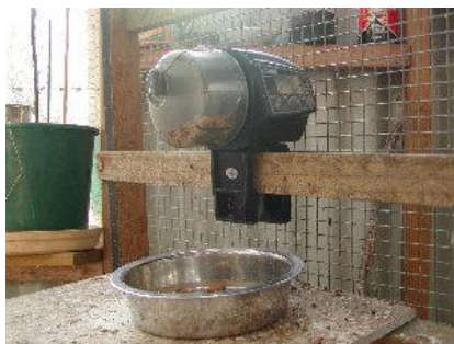
Fish feeder hard at work in the aviary situation.